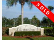
3458 63RD SQ, Vero Beach