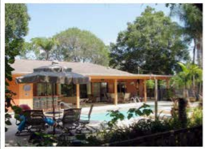
Gorgeous Custom Pool Home 3 BR/3BTH on Over an Acre $325,000