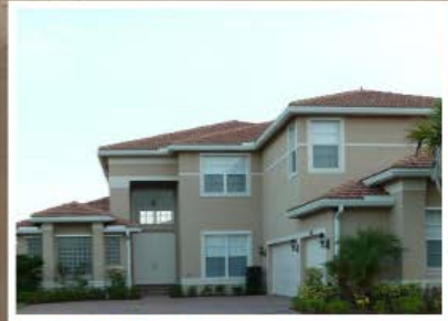
5BR 4BTH + Loft & 3 Car Garage New Home with Over $80,000 in Upgrades $289,000