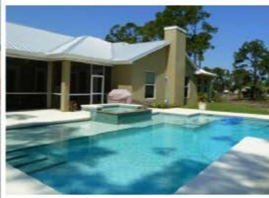
Luxury Vero Beach Pool Home Over an Acre of Property $600,000