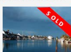
809 Spyglass LN, Vero Beach