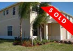
9919 Villa CR E, Vero Beach