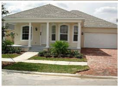
Southern Classic Point West Home Lake, Golf, and Nature Preserve Views $200,000