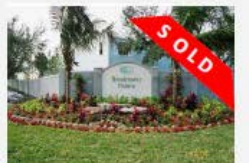
1155 3RD AV #104, Vero Beach