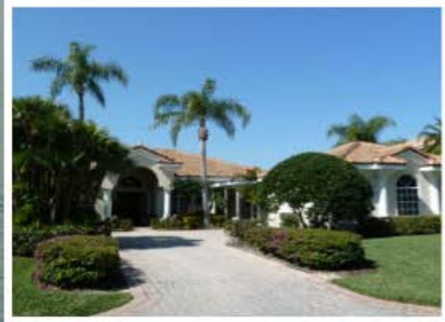
Grand Harbor Custom Estate Nature Preserve and Estuary Views $750,000