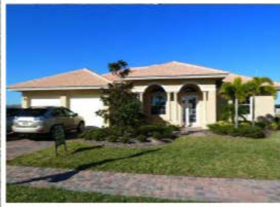
New Lakefront Model Home Wide Open Triple Split Floor Plan $309,000