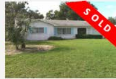
2165 45TH AVE, Vero Beach