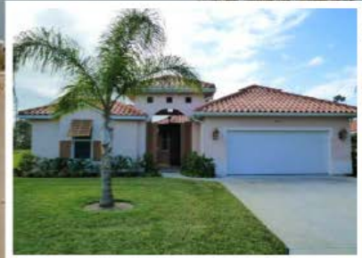
Private Cabana Courtyard Home 4600 Sq Ft with In-Law Suite $350,000