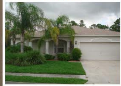
Lake View Home Spacious Living Space / Backs to Green Belt $157,000

"Know anyone who is thinking of buying or selling? Please Don't Keep me a secret!"