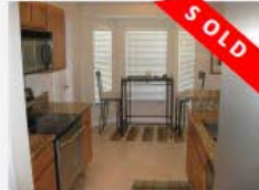
9226 101ST CT, Vero Beach