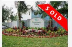
1155 3RD AV #104, Vero Beach