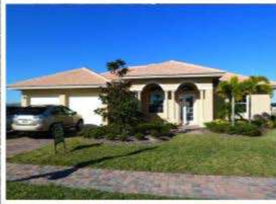
New Lakefront Model Home Wide Open Triple Split Floor Plan $309,000