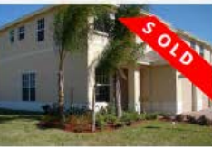
9919 Villa CR E, Vero Beach