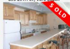
1901 Indian River BLVD, Vero Beach