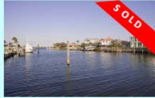
13 Dolphin Drive, Vero Beach