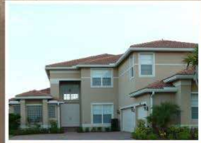
5BR 4BTH + Loft & 3 Car Garage New Home with Over $80,000 in Upgrades $289,000