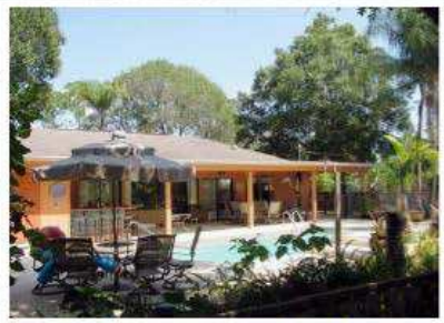
Gorgeous Custom Pool Home 3 BR/3BTH on Over an Acre $325,000