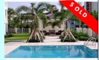
4117 Silver Palm Drive, Vero Beach