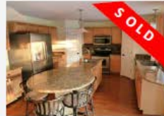
1257 25th TE SW, Vero Beach