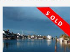
809 Spyglass LN, Vero Beach