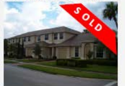
9983 E Villa CIR, Vero Beach