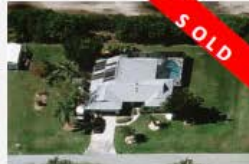
1105 54th Ave., Vero Beach