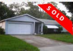
620 18TH PL, Vero Beach