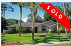
129 38TH CT, Vero Beach