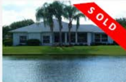
350 53RD CIR, Vero Beach