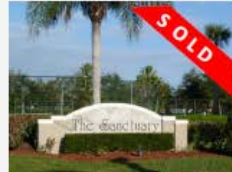
3458 63RD SQ, Vero Beach