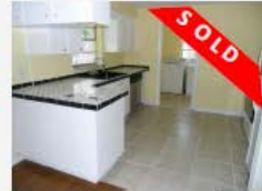
2041 12TH ST, Vero Beach