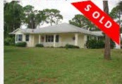
1016 19th ST, Vero Beach