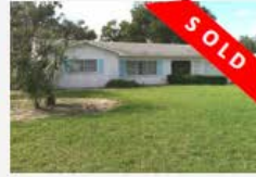
2165 45TH AVE, Vero Beach