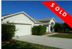
243 37th DR SW, Vero Beach