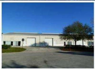
7500 Sq Ft Warehouse on an Acre Multi Use Office and Service Space $375,000