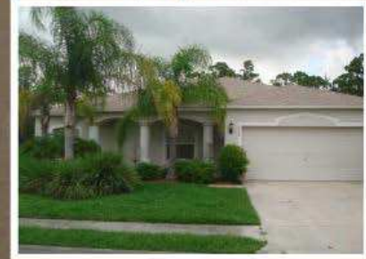
Lake View Home Spacious Living Space / Backs to Green Belt $157,000

"Know anyone who is thinking of buying or selling? Please Don't Keep me a secret!"