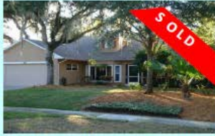
550 Camelia Ln, Vero Beach