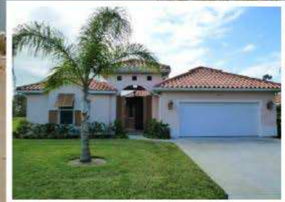
Private Cabana Courtyard Home 4600 Sq Ft with In-Law Suite $350,000