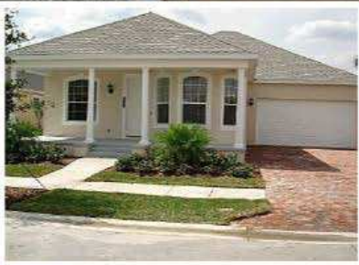
Southern Classic Point West Home Lake, Golf, and Nature Preserve Views $200,000