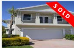
1965 Bridgepointe Cir #81, Vero Beach