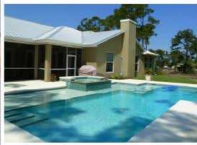
Luxury Vero Beach Pool Home Over an Acre of Property $600,000