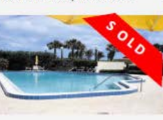
3939 Ocean DR, #212C, Vero Beach