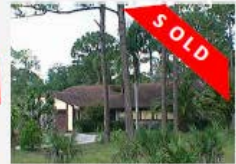
3459 58th Av. Vero Beach