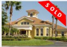
5095 Fairways CIR #106, Vero Beach