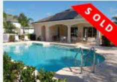
428 Tangerine Sq. N., Vero Beach