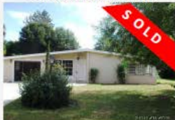
1865 50th AVE, Vero Beach