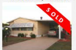
1230 Calusa DR, Vero Beach