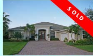
4177 Abington Woods, Vero Beach