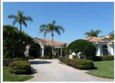
Grand Harbor Custom Estate Nature Preserve and Estuary Views $750,000